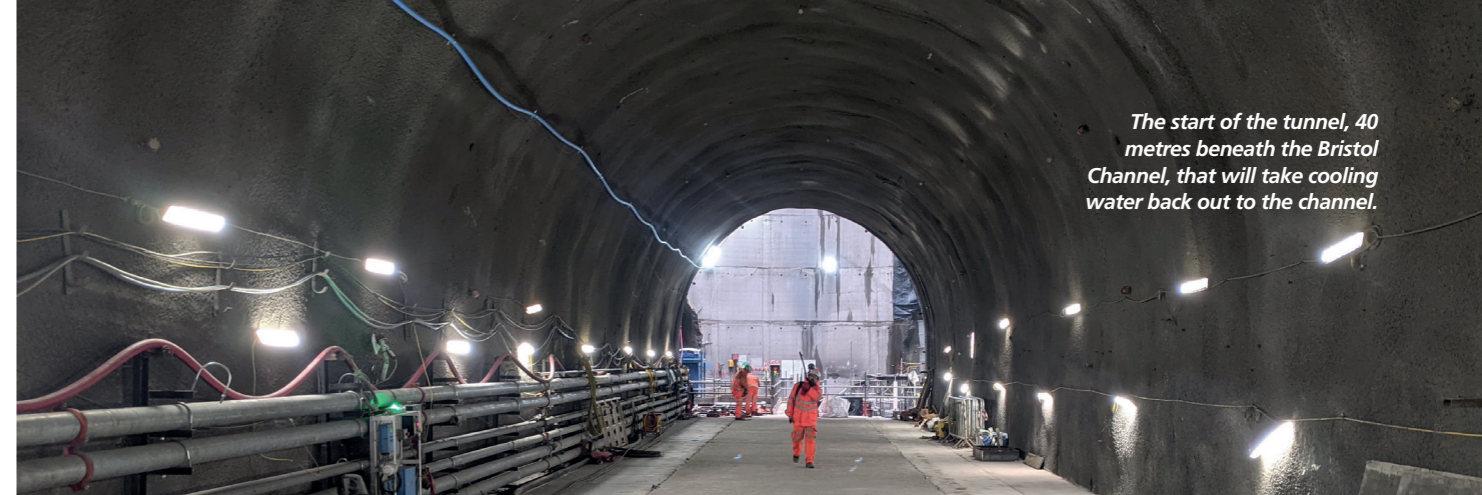
The start of the tunnel, 40 metres beneath the Bristol Channel, that will take cooling water back out to the channel.