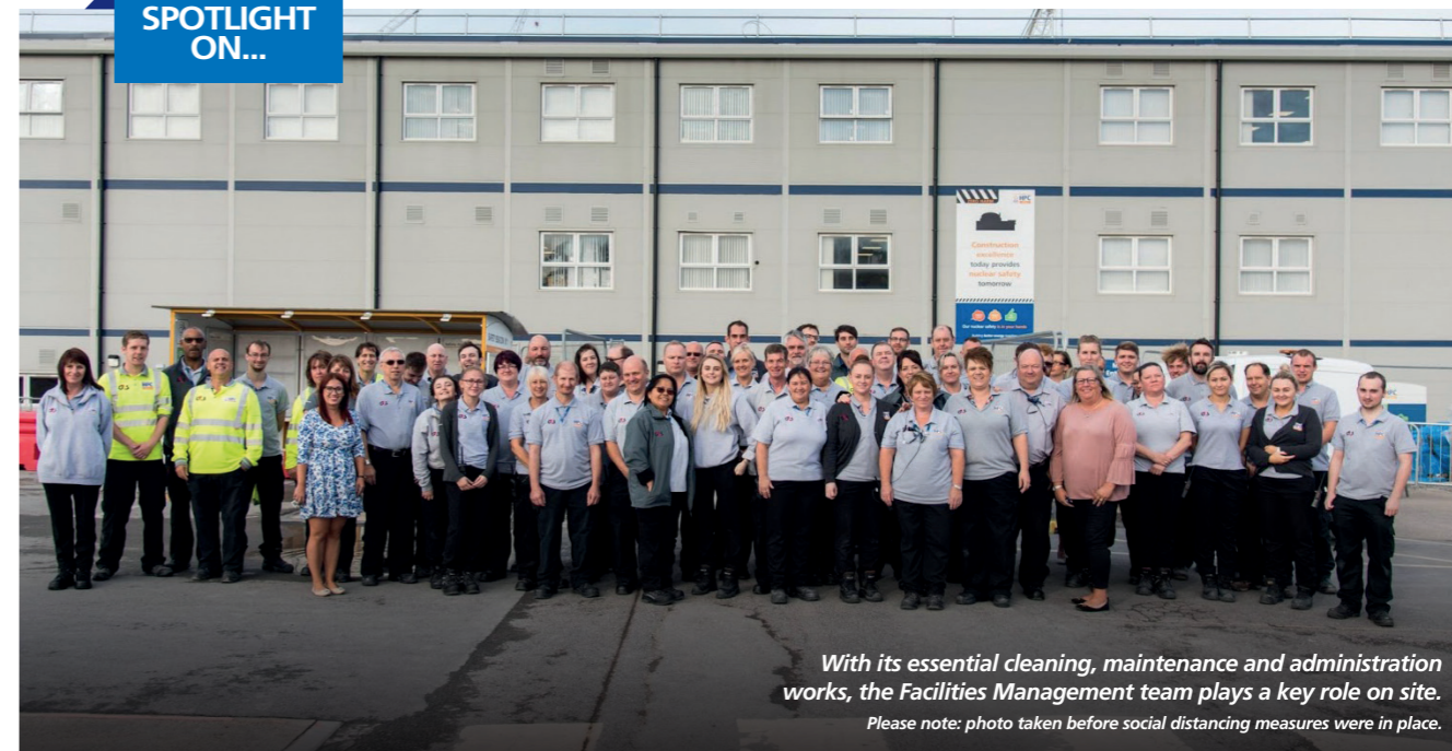
With its essential cleaning, maintenance and administration works, the Facilities Management team plays a key role on site.

Please note: photo taken before social distancing measures were in place.