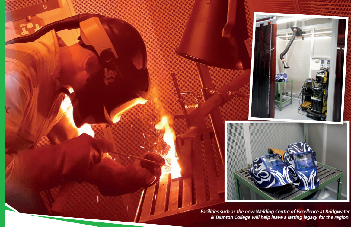
Facilities such as the new Welding Centre of Excellence at Bridgwater & Taunton College will help leave a lasting legacy for the region.