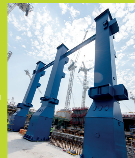
The blue TG structures standing tall in the Conventional Island.

In this area, pressurised steam created by heat from the twin reactors will be used to turn the turbine and generate electricity. When completed, the power station will be capable of generating 3,260MW of secure, zero-carbon electricity for 60 years.