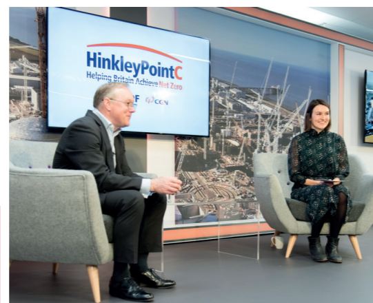
The virtual Dome 2022 conference (above) and a computer-generated image of the domed roof lift (top).

The dome is made up of 38 panels. It will weigh 200 tonnes and stand at 14 metres tall once the Big Carl crane has lifted it into place.