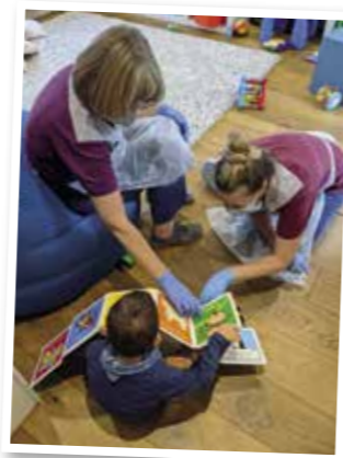
Children's Hospice South West care teams continue to care for local families throughout the pandemic.

Earlier this year, St Margaret's Hospice Care in Taunton received over £5,000 through the HPC Way Safe Day initiative.