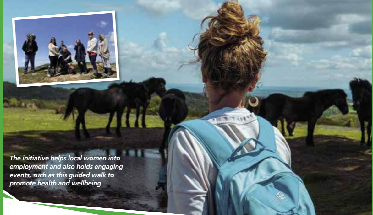
The initiative helps local women into employment and also holds engaging events, such as this guided walk to promote health and wellbeing.