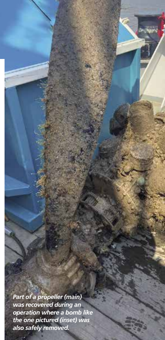
Part of a propeller (main) was recovered during an operation where a bomb like the one pictured (inset) was also safely removed.

Ian's team has spent the last six months clearing the seabed to make way for tunnelling for the power station's cooling water system. They have disposed of items including anchors and an aircraft propeller and engine.