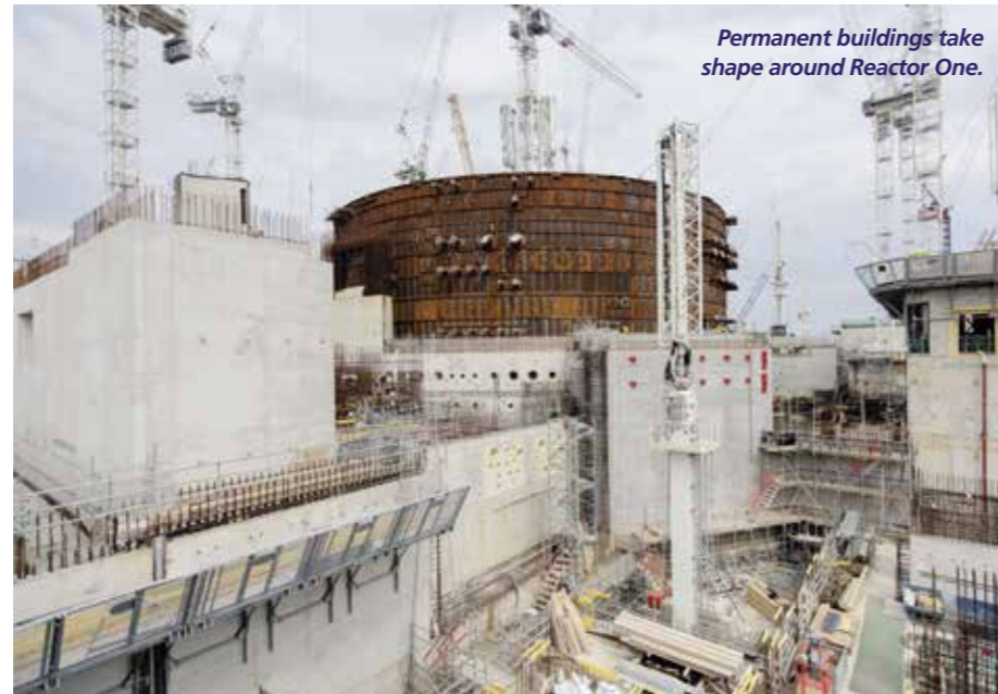
Permanent buildings take shape around Reactor One.

That's also good news for major infrastructure projects of the future – especially Hinkley Point C's proposed sister station at Sizewell in Suffolk.