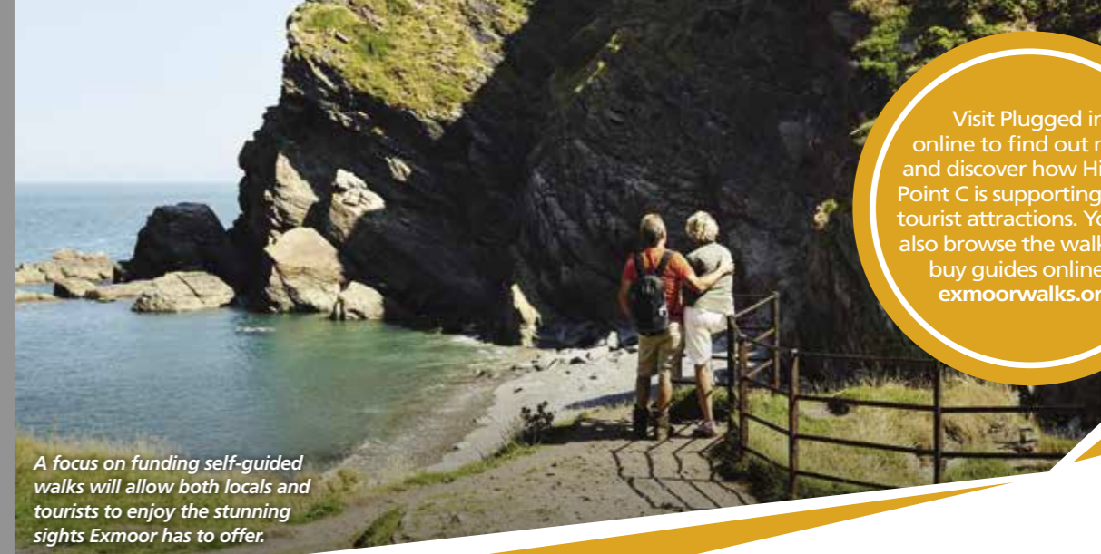
A focus on funding self-guided walks will allow both locals and tourists to enjoy the stunning sights Exmoor has to offer.

Visit Plugged in online to find out more and discover how Hinkley Point C is supporting other tourist attractions. You can also browse the walks and buy guides online at exmoorwalks.org .